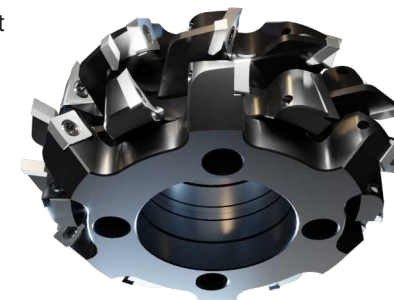
One of the two profiling heads

The machines that we offer today are the result of three decades of incremental improvements and complete redesigns, resulting in refined machines that are built to last.