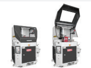
Liftable safety enclosure