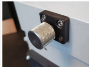
Manual locking to set blade at any angle