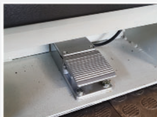
Standard foot pedal control