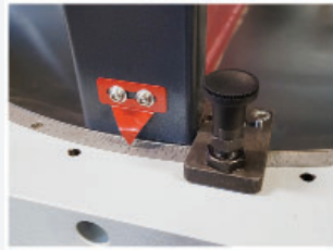
Quick indexing pin