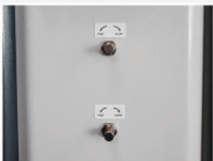
Adjustable clamping and cutting speed