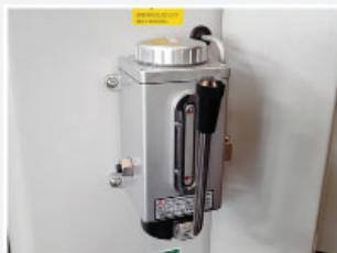
Oil lubrication unit