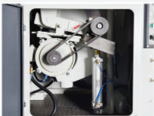
Powerful 7.5 HP motor & pneumatic cylinder