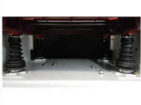
4 jack screws

The Cantek P815HV 32" Planer has a solid steel helical cutterhead with two-sided carbide knife inserts that require no adjustments when changing. With a digital readout and simple PC controller, setting the table height is quick, accurate, and easy. The frame is made from heavy cast iron with known vibration damping resulting in long bearing life and superior cut quality. The planer's segmented, serrated infeed roll & segmented pressure shoe ensures material is held firmly during the feeding and planing process. The P815HV planer has a quick-set micro-adjustable lever that easily raises and lowers the table rollers to aid in the feeding of difficult to feed wood. The industry standard 30x12x1.5mm carbide insert knives are positioned by two pins and held by a gib and screw which do not require any special tools to set the height. The knives have a slight bevel in the corners which provide for a superior finish without any stepping between the knives. In addition, the knives sit vertically into the head which produces a proper cutting angle and gully to allow for superior cutting depth.