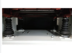
4 jack screws