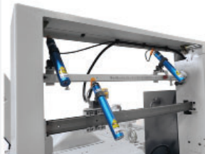
Projection laser for identifying the cutting line