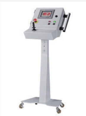
Touch screen control with joystick is situated on moving pedestal for operator convenience