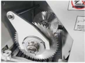
MRS340M1 with single moving blade and fixed saw blade

The Cantek MRS340M Moving Blade Multi Ripsaw is available with 1 or 2 moving saw blades. The motorized moving blade system is designed to provide you with maximum flexibility in your ripping operations to achieve the maximum yield from your material. The touch screen control allows the operator to pre-set the blades position(s) or jog the blades to achieve the desired ripping result. Each moving blade is controlled by a servo motor and is adjusted using a ball screw and linear guideway for the highest accuracy. The blade position is indicated with a laser projection line so the operator can visualize the cutting line to increase efficiencies. If you are looking to increase material yield and add flexibility to your ripping operations the MRS340M series is the ideal choice.