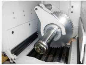
MRS340M2 with short stock pressure plate