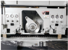
Pneumatic top hold down pressure assembly