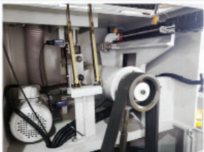
Industrial design with servo controlled moving blade(s), cast iron spindle housing