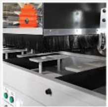
Bottom rubber covered feed rollers with top idle pressure rolls