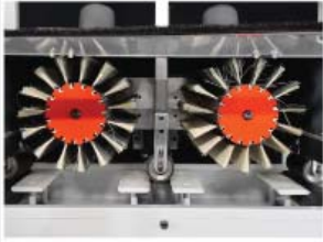
Counter rotating top brush sanding units can be angled for bevel material

The Cantek LBS300-5S 3-sided lineal brush sander is designed to help with your everyday linear profile sanding needs. It is ideal for sanding and denibbing lineal products including mouldings, skirting, architrave, flooring, MDF hardwoods and softwoods, paint, sealer, and lacquer sanding. The machine works well as a standalone unit, or as part of the finishing line.