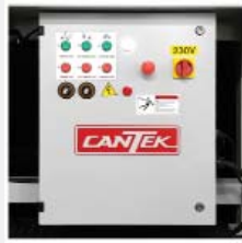
Control panel with VFD adjustment to the sanding units and individual on/off buttons