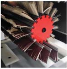
Brush sanding strips are easily removeable for fast grit change