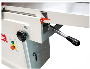
Infeed bed adjustment