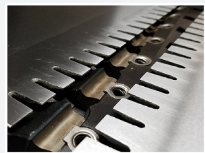
Noise cancelling table lips