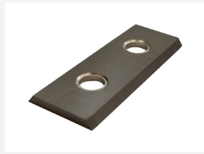
Two-sided solid carbide insert knives