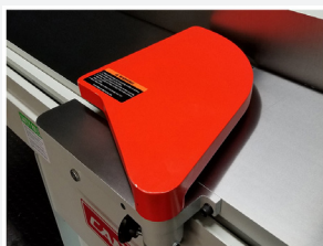
Boomerang safety guard