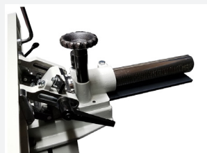
Fence adjustment by rack and pinion and tilting with positive stops of 45°, 90°, & 135°