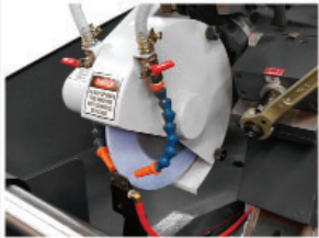
Precision dresser assembly with straight and radial diamond dresser mounted above the wheel for easy access

The Cantek JF330A Profile Grinder was designed to ensure the operator can produce an optimum knife finish, while producing precisely accurate profiles. The powerful 3HP grinding motor makes knife grinding a breeze. The VFD allows the operator to dial in the optimum grinding speed no matter what type of knife steel they are grinding. Using an axial constant setup, tools can be transferred to the moulder quickly for precise and fast changeovers. The cutterhead is mounted to a sliding worktable which runs on high precision Schneeberger linear bearings. All these features make the JF330A profile grinder the ideal solution for the small to large size moulding shop.