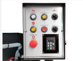
Centralized control panel with VFD control for grinding wheel speed and digital speed readout