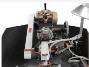
Convenient wheel angle adjustment (side clearance). Motorized setting optional