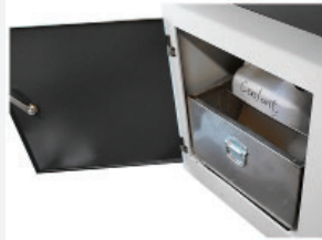
Easily accessible stainless steel coolant tank. All guarding is stainless steel