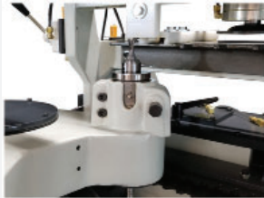
Precision spindle head