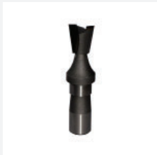
Two flute dovetail bit (standard)