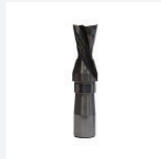
Two flute solid carbide dovetail bit (optional)