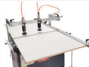
Fence can be attached to side fence for boring shelf holes and more