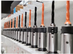
21 spindles with quick change chucks for fast boring pattern changeover