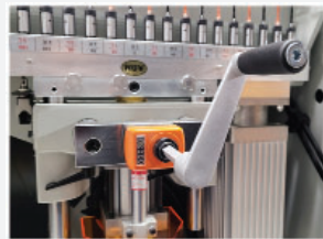
Boring height is conveniently and accurately adjusted with a mechanical counter