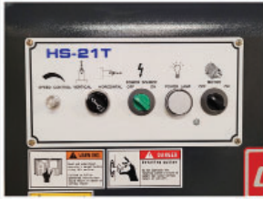
Centralized control panel

The Cantek HS21T 21-Spindle Construction Drilling Machine is a versatile construction drilling machine which is capable of line boring, end drilling, & construction drilling functions. The HS21T has a robust fabricated steel construction with precision machined cast iron table. The boring head is cycled pneumatically and runs on precision linear guide rails for smooth drilling cycles. A 2 ½ HP motor powers the boring head with 21 gear driven drill bits and operates at 2800 RPM. Each spindle is equipped with a quick-change chuck to facilitate fast changeovers between drilling operations. The machine comes equipped with fold away side fences which are positioned using a linear scale. The 118" (3 meter) back fence is equipped with (4) flip tops which is ideal for positioning panels during line boring applications and more. The boring head is effortlessly tilted from 0-90° by a pneumatic cylinder. It can also be locked in any position between 0° and 90° for angle drilling operations. Boring depth is quickly and precisely adjusted using a 6-position turret system. Workpieces are held firmly in place by (2) pneumatic clamps.