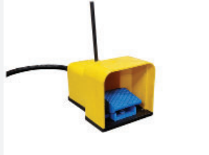
Foot pedal executes boring cycle