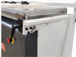
Side fences can be safely and easily folded away when not in use