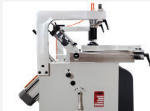
Boring head can be tilted from 0 - 90°