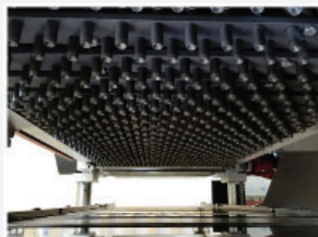
Spring loaded pin feed system