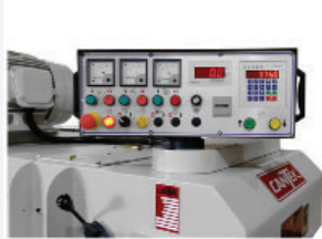
Ergonomic swivel control panel