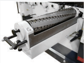
Removeable bottom cutterhead