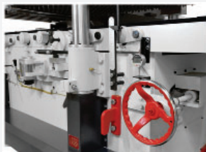
Infeed bed adjustment