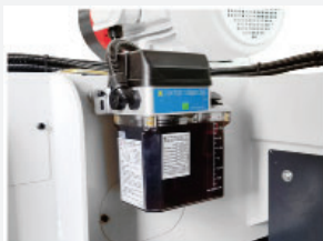
Auto lubrication to feed conveyor