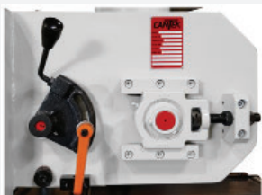
Feed pressure adjustment