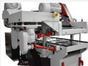
With safety covers removed