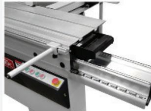
Precision Anodized Aluminum Sliding Table with Hardened Linear Rails