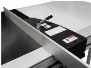
CNC Rip Fence with 51" Rip Capacity