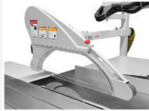
CE Overarm Dust Collection & Safety Guard