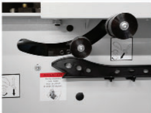
Scoring Lateral & Height Adjustment