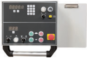
Eye-level Control Panel & Clipboard

The Cantek D405ANC 1-Axis Sliding Table Saw is the ideal sliding panel saw for high accuracy cutting of sheet materials for the production of kitchen cabinetry, furniture, millwork operations, and more. The NC rip fence provides the operator with the added convenience of setting the rip width automatically through an eye level control. This saves time while providing a high level of accuracy and repeatability. The 10' sliding table is made from a precision aluminum extrusion and runs on precision linear guide rails.