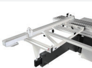
Crosscut Miter Fence with Two Stops