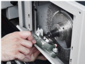
Outboard bearing to support the brushing spindle