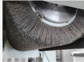
2nd Head: Abrasive Nylon Brush Tynex