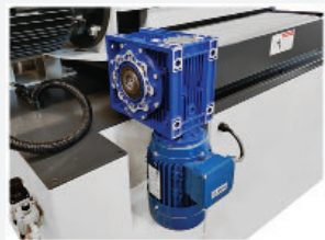
1 HP feed motor