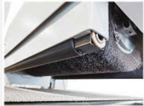
Spring loaded rubber hold down rollers before and after each brushing unit