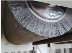
1st Head: Wire Brush Head Medium Structuring