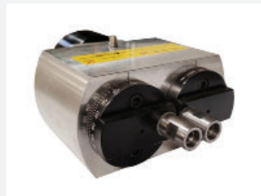
Two Spindle Adjustable Boring Head