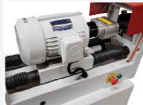
Powerful Direct Drive Boring Head