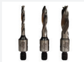
Threaded Shank Boring Bits