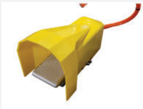
Foot Pedal Actuation