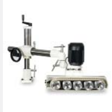
Feed roller spacing