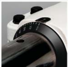
Inclinable feeder support arm