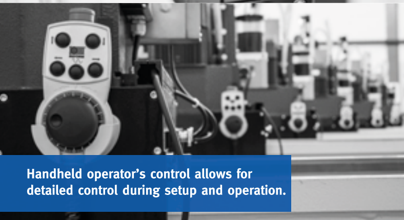
Handheld operator's control allows for detailed control during setup and operation.