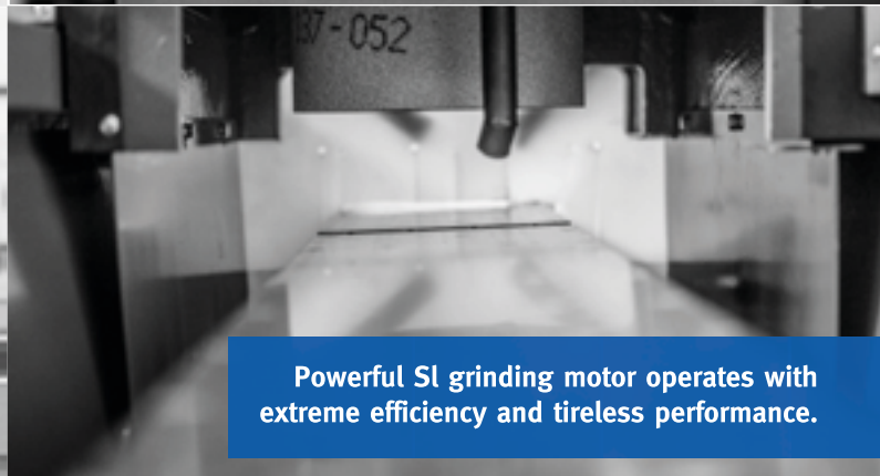
Powerful SI grinding motor operates with extreme efficiency and tireless performance.