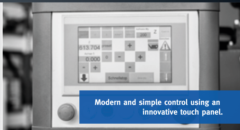
Modern and simple control using an innovative touch panel.